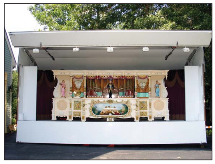
Figure 10. The Diamond Jubilee organ open and ready for business in the new display trailer. Signage on the trailer is in the works.

Moving Company. Four large strong men with a lot of experience and an impressive crane made lifting and moving the organ look (relatively) easy. Once the organ was re-assembled on the trailer it was finally time to hear what she really sounded like outdoors ( Figure 10 ). Once again the Liberty Bell rang out, this time with the tuning in better shape, and it was wonderful. Before long we had a crowd of small children from around the neighborhood dancing in front of it and I knew that I was going to love being a Gaviman.