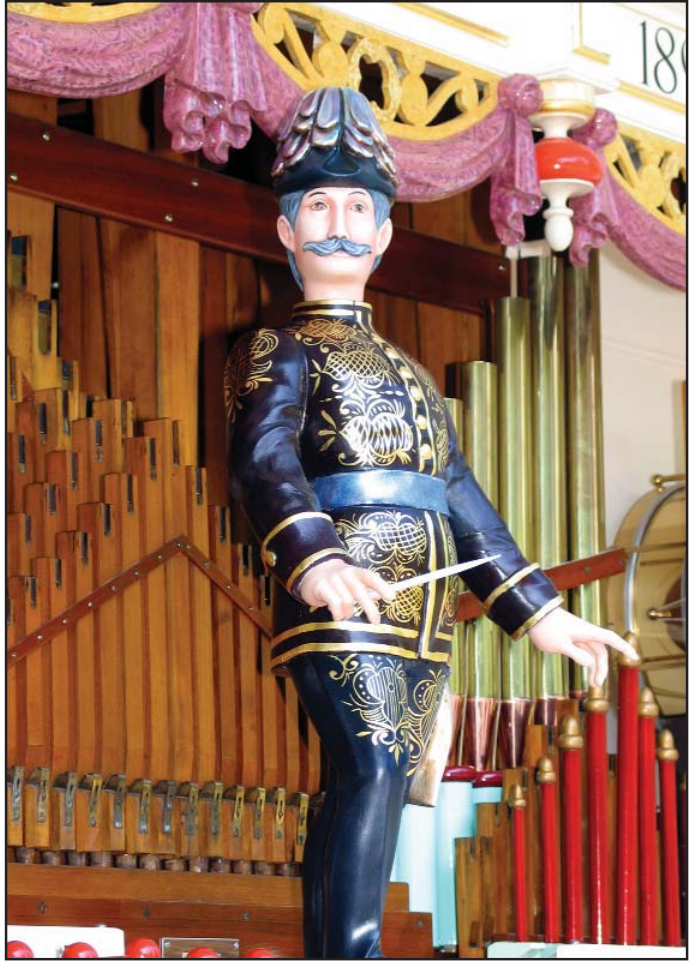
Figure 11. The bandmaster of the Diamond Jubilee Gavioli. It was newly carved in lime wood at the Verbeeck shops in Belgium

that organs of this style often had wider facades, with extra cases flanking the drum cases as well as elaborate prosceniums on top of the organ. Because we will use this organ as a stand-alone fairground display, I decided to add appropriate extra side cases, modeled after those on Brian Well's instrument, and to replace the figures that had been separated from the organ during its years in storage. I built the new cases using the exact molding profiles of the rest of the case, making resin castings of the carved parts of the original case for use on the side cases, and going to England to make copies of the curved carvings found on the ends of Brian's Gavioli. Over the winter Andrew Whitehead had built a reproduction Gavioli glockenspiel that I installed on the front shelf (after making the belly case 3" deeper to accommodate the depth of the glockenspiel). Finally we commissioned Johnny Verbeeck's shop in Belgium to make new carved figures; a bandmaster to stand in the center (Figure 11) and two bell ringers to stand in the outermost cases. Signs for the top were made, painted and gilded around the edges to give the top a more finished appearance and she was ready for a public appearance.