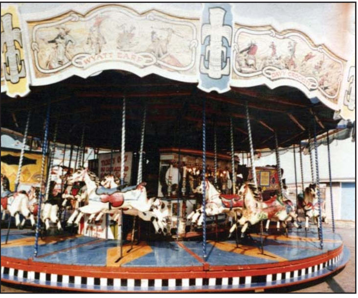
Figure 2. The gallopers at Wonderland Amusement Park, Cleethorpes with the Gavioli mounted in the center. The photo is probably from the 1960's.

From every direction came the most amazing music I had ever heard. Huge, powerful organs with gilded fronts and gleaming brass trumpets were pumping out marches, waltzes, and even operatic arias. The names emblazoned on their casework were unfamiliar and exotic: Gavioli, Marenghi, Mortier, and Limonaire ( Figure 1 ). Much as I loved the three honking bass notes of a Wurlitzer 150, these organs with their full complement of notes, ability to automatically change registers, and bank after bank of pipes transfixed me. It was band organ music on steroids, and I knew that I had to have one of those astonishing machines.