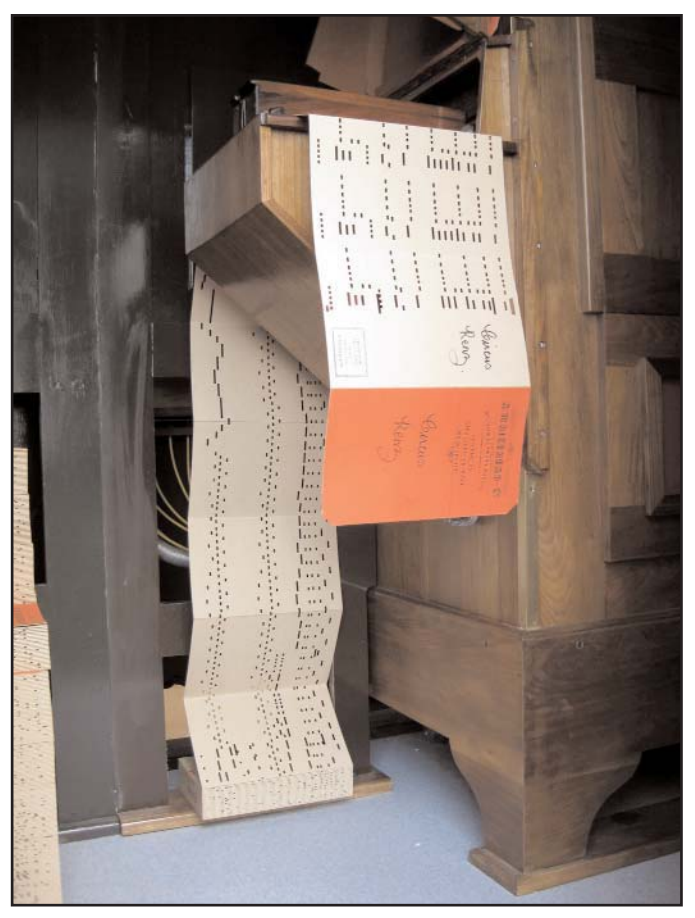
Figure 12. The Gavioli playing Circus Renz at the COAA rally in Olcott Beach, NY.

The first public showing of the Diamond Jubilee Organ was at the Mid-Am MBSI rally at Roscoe Village, Ohio. The days were very hot and humid and, novice