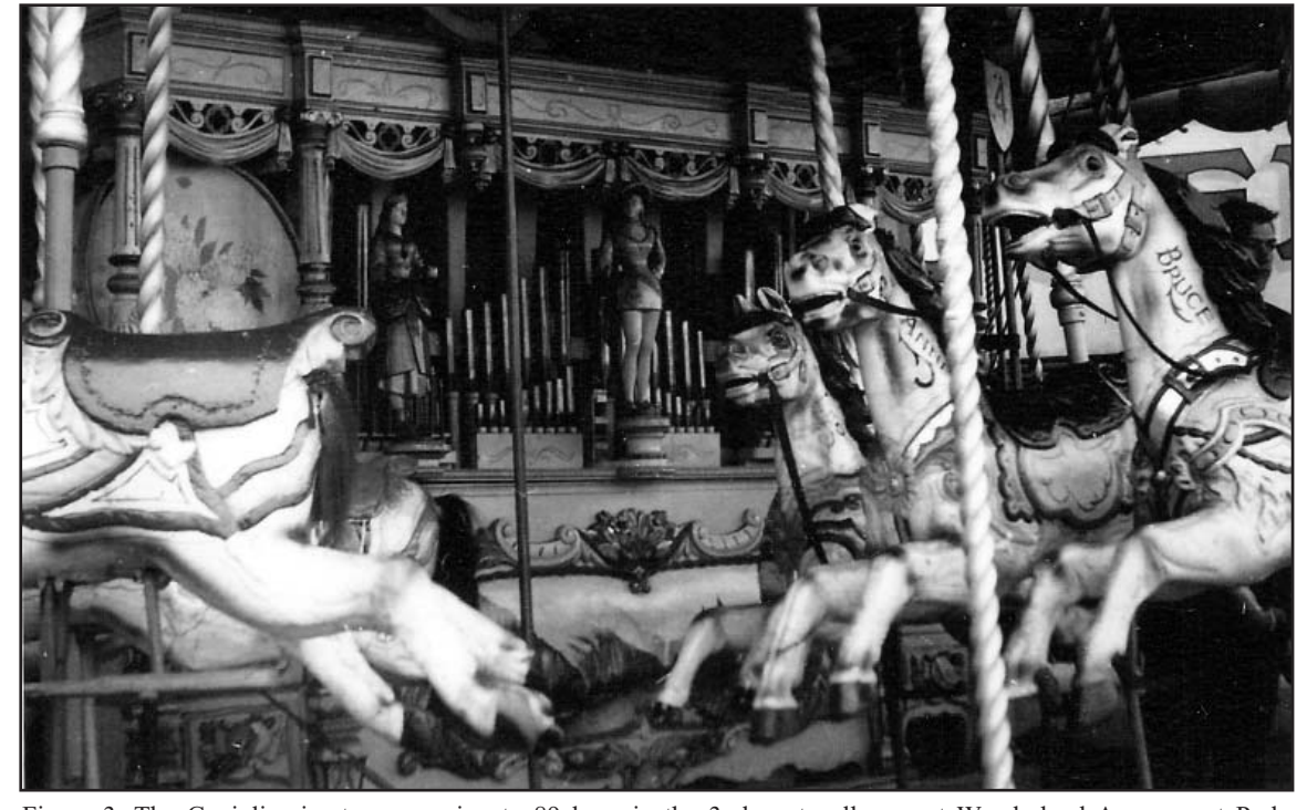
Figure 3, The Gavioli prior to conversion to 89 keys in the 3-abreast gallopers at Wonderland Amusement Park, Cleethorpes, England.

Prior to this inglorious end the organ led a long and productive life in show land. It was built as an 87-key organ by Gavioli in Paris. probably between 1895 and 1899-we've arbitrarily declared it's