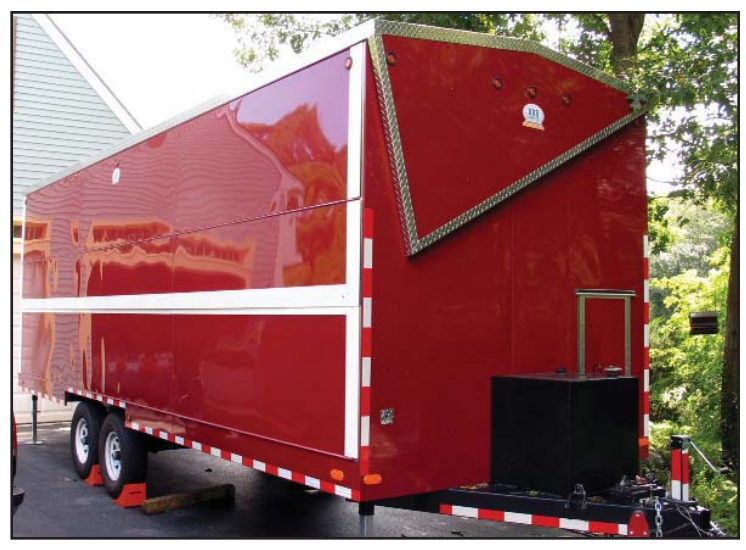
Figure 9. The display trailer is ready to travel. The trailer is 24 ft long (without tongue), 11'4" tall when traveling and 8' wide. It carries a 5500 watt diesel generator and sufficient fuel to run for 100 hours. Opening the trailer for display can be done by a single person.

Moving Company. Four large strong men with a lot of experience and an impressive crane made lifting and moving the organ look (relatively) easy. Once the organ was re-assembled on the trailer it was finally time to hear what she really sounded like outdoors ( Figure 10 ). Once again the Liberty Bell rang out, this time with the tuning in better shape, and it was wonderful. Before long we had a crowd of small children from around the neighborhood dancing in front of it and I knew that I was going to love being a Gaviman.