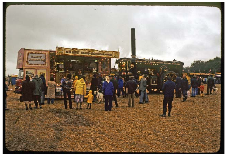
Figure 1. The Great Working of Steam Engines at Stourpaine Bushes, 1979. My first acquaintance with the big European fairground organs. At that point I hadn't realized that "Wellies" and a slicker were de rigueur for the Dorset Fair.

The Stourpaine fair comprised more than two hundred acres filled with every possible steam driven contrivance (no doubt a few impossible ones as well). The traction engines, plows, rollers, sawmills, threshers, cars and boats were amazing enough, but completely unexpected were the showmen's engines. These hissing monsters, each one the size of a small locomotive, decked out with polished brass, bright paint, and festive lights, were